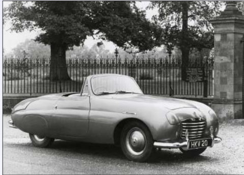
Triumph TRX, 1951