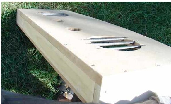
This illustration shows the solid construction of the speaker box. The baffle board averages more than a foot deep and almost three feet wide, offering a vastly superior mounting for speakers compared to any other options I could accommodate.