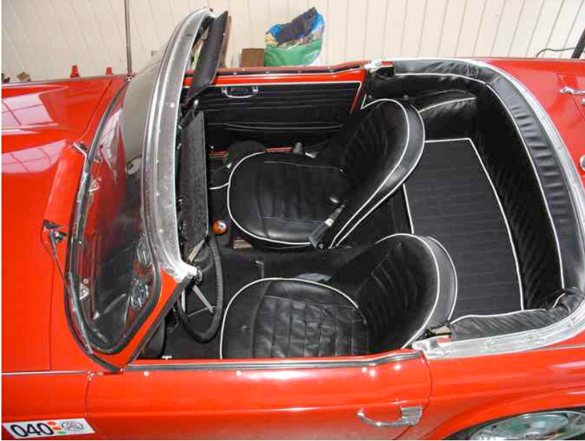
A final shot of the overall look of the car's interior complete with the speaker 'seat' mounted on the rear shelf.

This was a fun project that is easily completed in one or two weekends. The woodworking skills and tools are minimal, and well, the sewing was an adventure that was easier, and produced better results, than I had hoped.