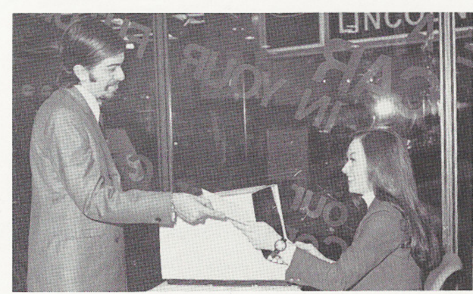
New York Auto Show guest hands completed question form to the Triumph Computer Girl. She then typed the data into the computer, producing results similar to those at the top of the page.