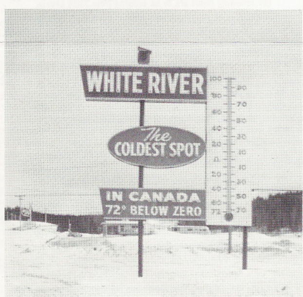
No starting problems with the TR-6 despite minus 40 weather. White River is 1900 miles from Crowsnest and still many miles to go to White Horse, Yukon.

The only modifications I made to the car since I purchased it was a set of Michelin tires. I am well satisfied with the performance and pleasure I derive from driving this car. In August I toured the New England states and ended up cutting through the southern United States and winding back through Kentucky. There the roads are very well suited for this kind of car. It's a great touring car and a lot of fun to drive. After sixty-eight thousand miles, the car hasn't given me one ounce of problems. Perhaps I'll try for another 68,000?