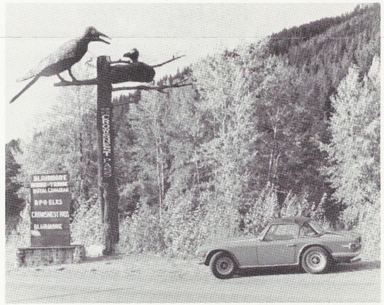
Richard Wagner's TR-6 shown at Crowsnest Pass, Alberta, ready to take off for a winter excursion up the Alaska Highway. Local inhabitants usually ride with dog teams!