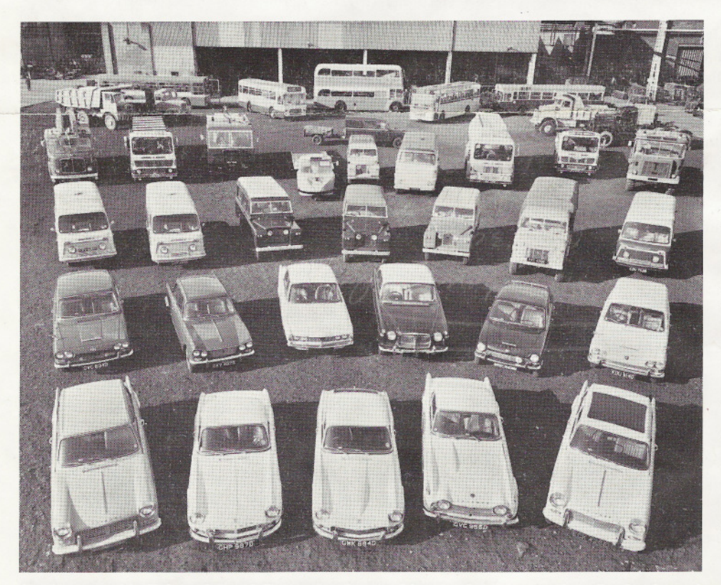
Beginning with Triumphs and Rovers and stretching back to heavy-duty Leylands and Albions, the products of Leyland Motor Corporation are ranked in front of one of the assembly halls. Photo taken prior to merger with BMH.