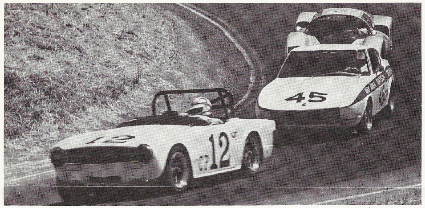
This one had to be printed big! Lee Mueller is shown at Laguna Seca, leading a 240Z and a Porsche 906 sports-racing car.