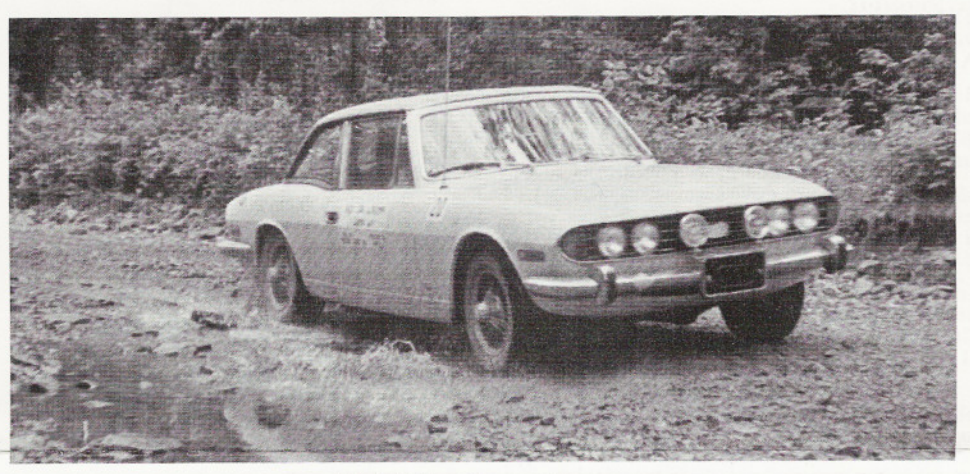
"Splashdown" en route.