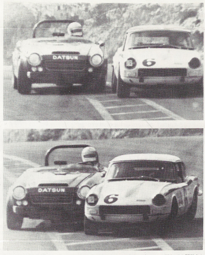
Fitzgerald drifts out . . . contact!