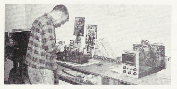
The man himself, assembling with care.

TR Register - Terry Simpson 100 High Street, Redbourn St. Albans, Herts, England