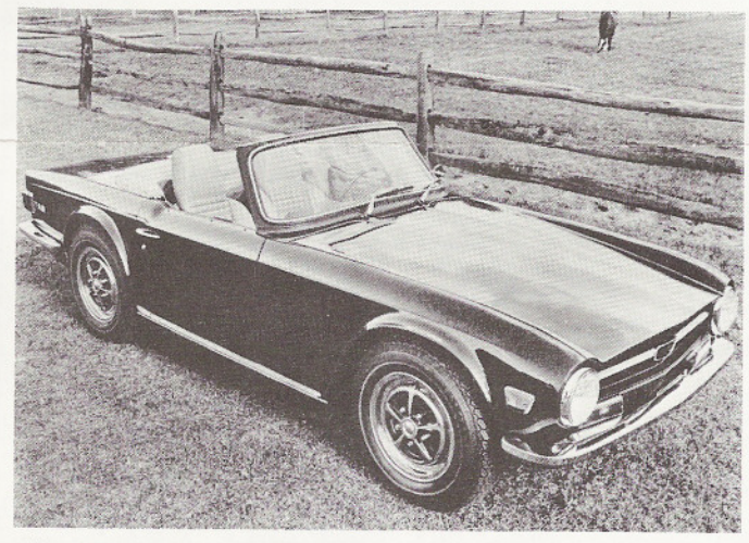
The TR-6 has a handsome new body styled by Karmann-Ghia, wider wheels and a front anti-sway bar for stability and a redesigned cockpit for increased driver comfort and convenience. Red-band radial tires are standard.