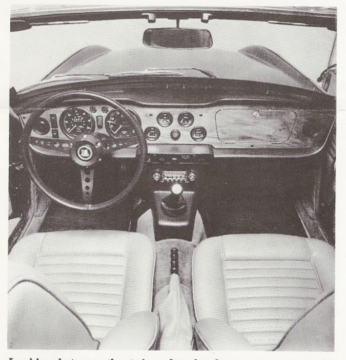
Looking between the twin safety headrests you can see the neat, easily-read instruments. Other interior features include contoured Ambla-covered seats with perforations for hotweather comfort and for fresh-air vents.