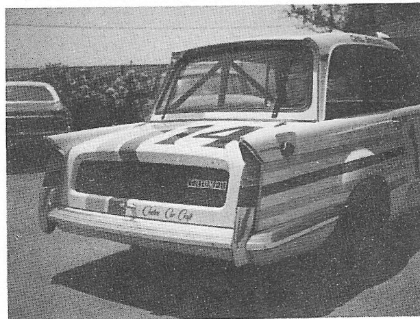
Back view shows the roll cage inside, fender flares, cap for safety fuel cell and central exhaust. Car has 2-litre, 3-Weber Triumph six, suspension similar to GT-6 Mk 3.