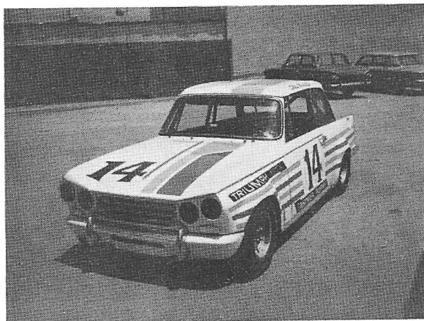
It's hard to appreciate the paint job in black and white. The car is white with stripes in orange and yellow.