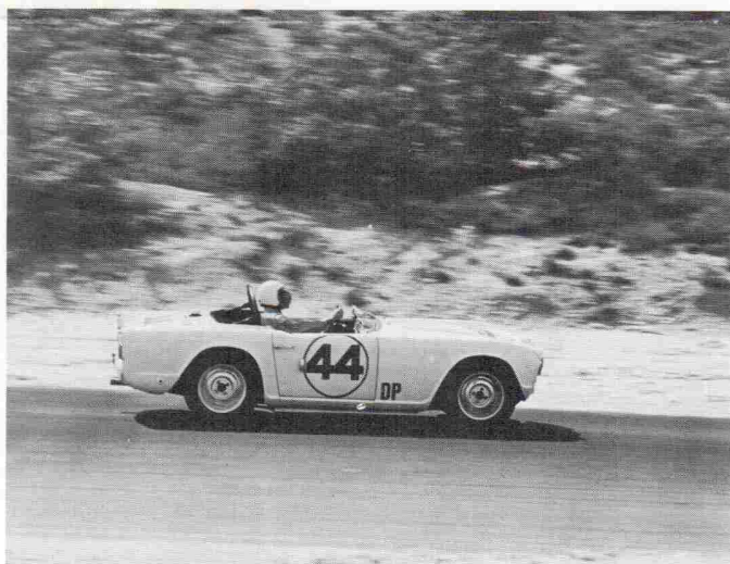
Bob Tullius led the DP and EP race for some time, finally, due to loss of power, finished 2nd in Class.