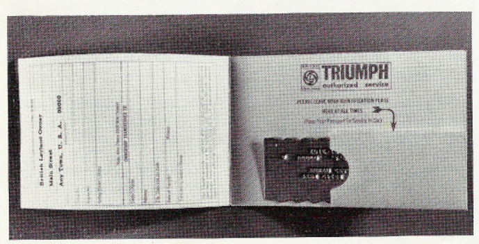
Owners of new 1970 TR's will receive an identification plate to be kept in the voucher booklet.

The new Triumph "Passport To Service" world-wide British Leyland warranty voucher booket.