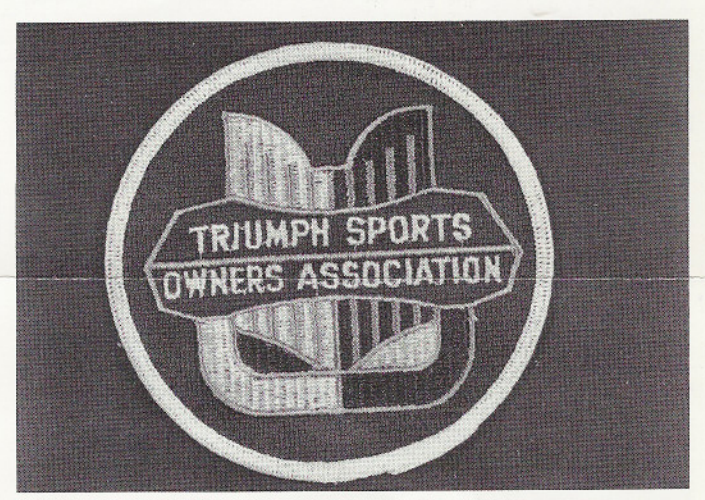
Official TSOA jacket emblem, black, blue, and white. $1.00 ea.

Some other items you may not have remembered are below.