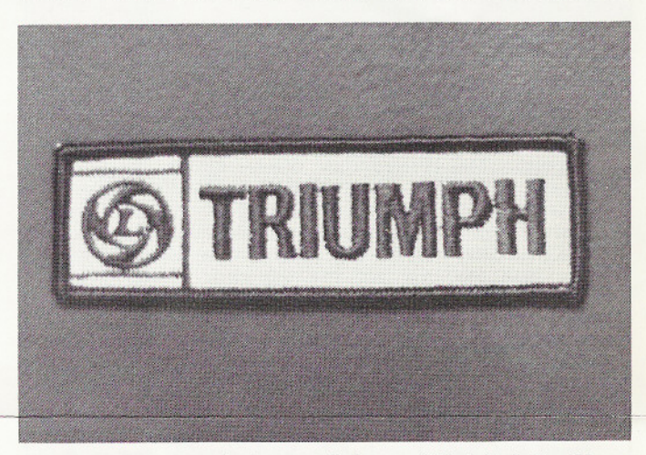
Triumph jacket patch (as supplied on official jacket). .50 ea.