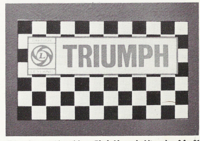
Triumph competition stickers. Black, blue and white mylar. 3 for $1