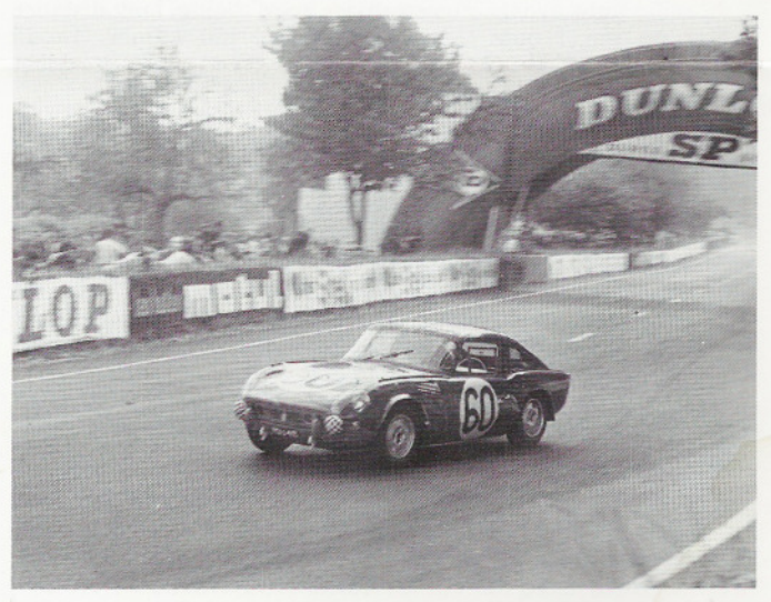
In 1965, a team of Le Mans Spitfires competed in the famous 24-hour event, finishing first and second in class. This "special" body which was used in both racing and rally events, later took on a more refined shape and appeared on the production GT-6, an equally raceable machine.