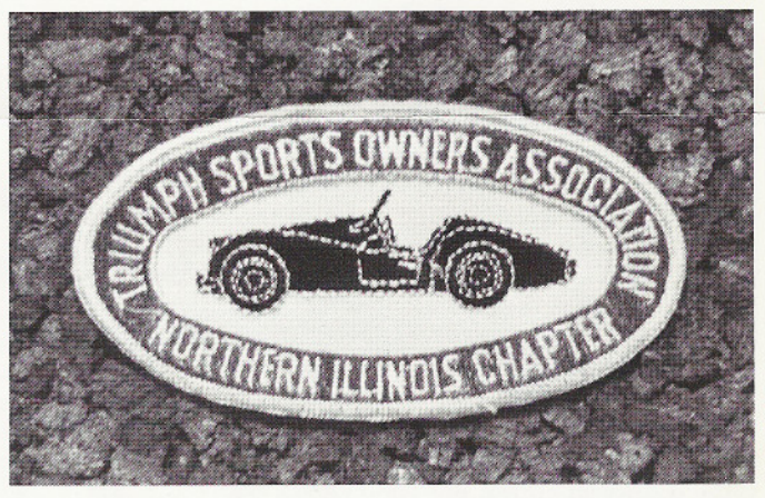
Northern Illinois . . . please let us have your address. The attractive patch above mysteriously turned up in our copy file with no address of the chapter. Can't find it anywhere . . . please write and tell us!