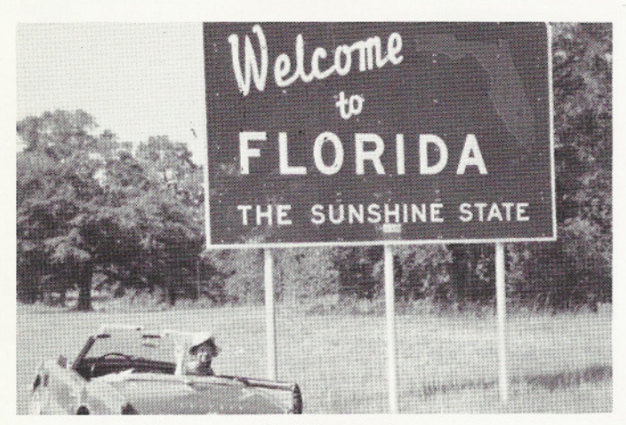
From one end of the country . . . . .

This past summer a girlfriend and I toured the United States in my Triumph Spitfire Mk 3. Our destination was San Francisco — our starting point, Closter, New Jersey. The entire month of June was spent touring the southern part of the Unted States. We traveled many different routes because we did quite a bit of sightseeing. Virginia Beach, Bellingrath Gardens, New Orleans, Houston, Carlsbad Caverns, Grand Canyon, Painted Desert, Petrified Forest, Las Vegas, Disneyland and Big Sur. It was a wonderful experience, where we encountered a variety of people — from a farmer to a professional gambler in Vegas.