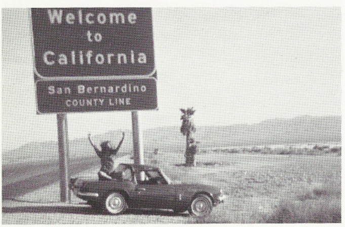
..... To the other.

P.S. — We put over 12,000 miles on the car.