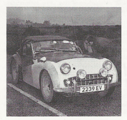
Register members at checkpoint in the lonely Yorkshire Moors on the '72 Vagabond Rally.

Sources for non-rusting fibreglass body panels . . . an article on owning and driving an ex-factory team TR-4 rally car . . . how to overhaul Girling brakes . . . how to switch from Lockheed to Girling . . . the fine points and morality of using fibreglass where steel was original equipment . . . on and on and on. All of this and much more is contained in the 10th issue of the TR Register Newsletter. This unusual publication contains many "fix-it" hints of the sort that only enthusiasts can produce, plus interesting club news, accounts of Triumph history from more personal views, etc.