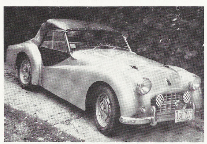
"Grendel", late of the pizza circuit.

When purchased she displayed considerable rust about her bulbous flanks and was swathed with cut up army blankets in an attempt to keep the pizza from congealing prior to delivery. When this blanketing was stripped away flawless upholstery of grey leather and grey and white