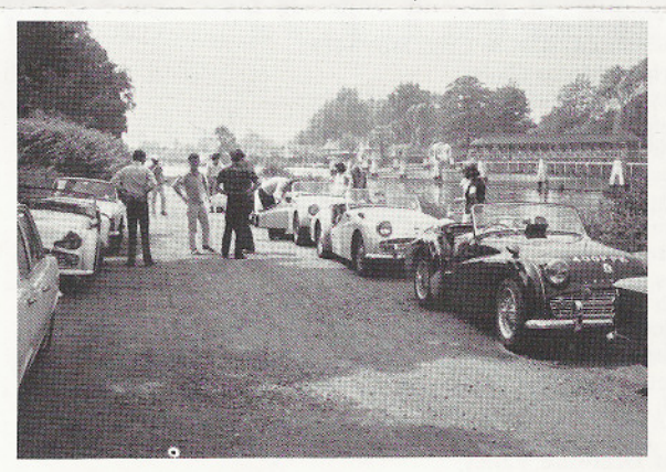
Parked along the Thames. No one can say that Register members don't turn out in force!